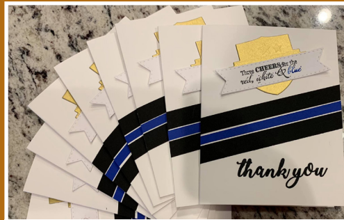
Cards for First Responders