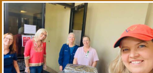
Meals to St. David's Hospital Staff