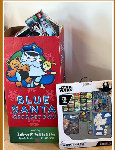
Blue Santa Toy Drive