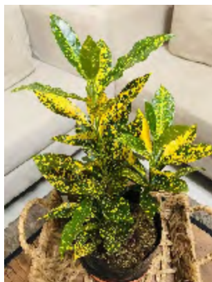
Gold Star Croton