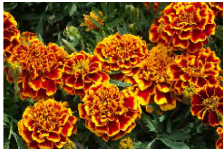
French Marigold Colossus