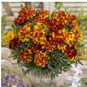
French Marigold Bolero

If you want to create a color scheme for this Fall to get you into a festive mood, a combination of marigolds and crotons all have great fall colors. There are many varieties of marigolds and crotons to make your selection from.