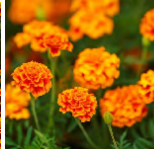
French Marigold Fiesta