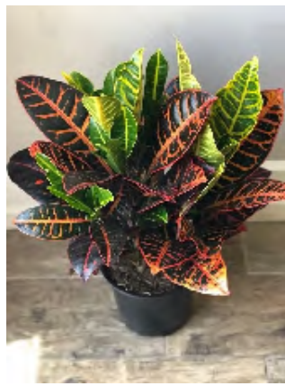
Florida Select Croton