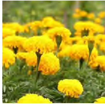
French Marigold Lemon Drop