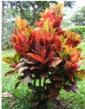
Red Icton Croton