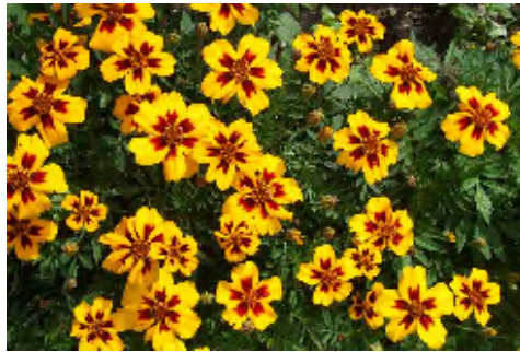
French Marigold Naughty Marietta

You can also embed crotons among the marigolds to create more interest.