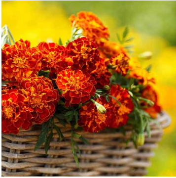
French Marigold Harmony